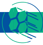
Table II: HexWeb® CR III 5056 Hexagonal Aluminum Honeycomb